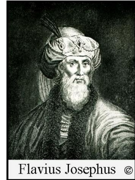
Flavius Josephus

The historian Flavius Josephus was a Jew, born in Jerusalem about A.D. 37. He was not a follower of Jesus, but he wrote that Jesus taught men, worked marvelous deeds, and was killed on a cross by Pilate at the urging of Jewish leaders (Josephus, The Antiquities of the Jews , 18, 3.3). The death of Christ for us is the central message of the Bible. His death was foretold by prophets, recorded by New Testament writers, and verified by historians.